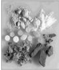
National Institute Drug Abuse

Abuse and addiction to alcohol, nicotine, and illegal substances cost Americans upwards of half a trillion dollars a year, considering their combined medical, economic, criminal and social impact.